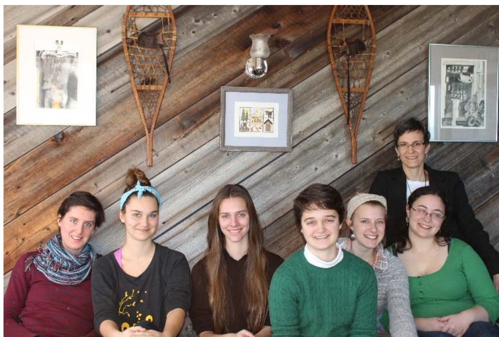
Image 3: Students went on a mini-retreat with staff from CEEDS and the Wurtele Center for Work and Life to reflect on their work and experiences within the Environmental Concentrations.

The students also felt that one of the primary goals of the College should be to educate students in sustainable life practices. The class suggested that sustainable-living education begin as soon as new students arrive during orientation week. Students could be trained then to use the composting system and other resource saving programs on campus. They reasoned that Smith's legacy could only be enhanced by using the campus as a classroom and teaching students how to steward the resources that sustain them, thus making it more possible for graduates to fulfill their responsibilities to the local, national and global communities in which they live.