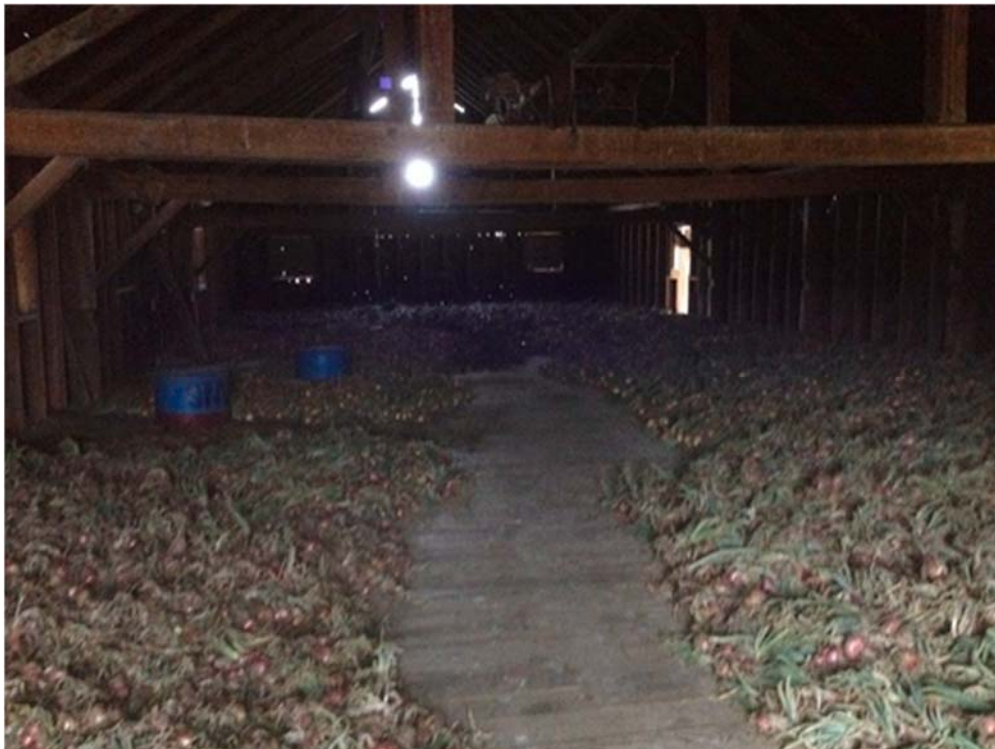
Image 5: The onion harvest in the barn after a long, hard day's work.

“This experience was life changing for me. I learned more than I ever thought possible at a farm, was exposed to so many different ideas, met so many different people who are passionate about agriculture and think and discuss critically how agriculture fits into addressing our current environmental problems. I learned to value the work that goes into producing my own food and to value good food. I no longer want to eat food that has been mass produced, severely adulterated, pumped full of chemicals and disrespected, because I know the pleasure I feel when I eat food that has been produced with thought, care, and respect. I know the toil that was required for the food to reach my plate, and I know the joy that food can bring to people. Overall, I have great respect for the food I eat, a critical eye for choosing the food I eat, a respect for hard physical work, and an understanding that farming is not a job for those who are not willing to work hard while thinking even harder. Farming requires a lot of knowledge, attention to detail, critical thinking, and ability to research.”