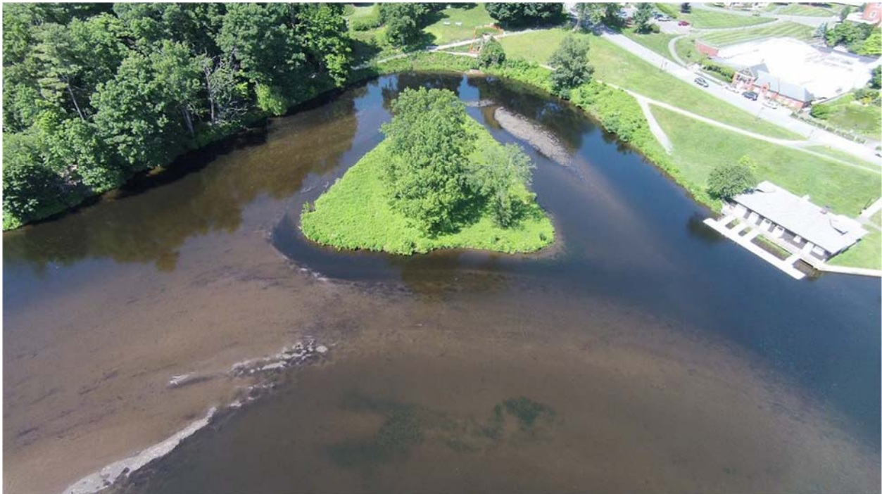
Image 10: Aerial view of sediment accumulation in Paradise Pond taken by a Spatial Analysis Lab drone.