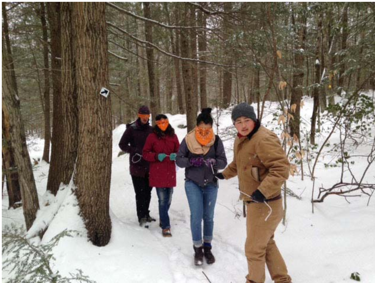
Image 7: Students from LSS 110J experiencing the landscape in a new way.