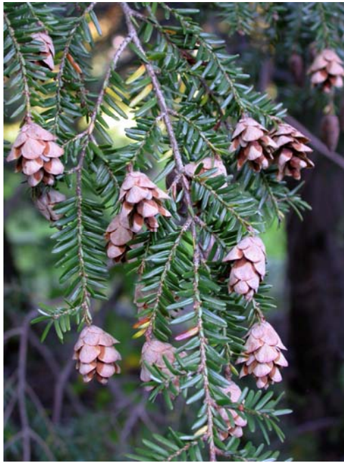
Image 12: Hemlock branch with cones at the MacLeish Field Station.