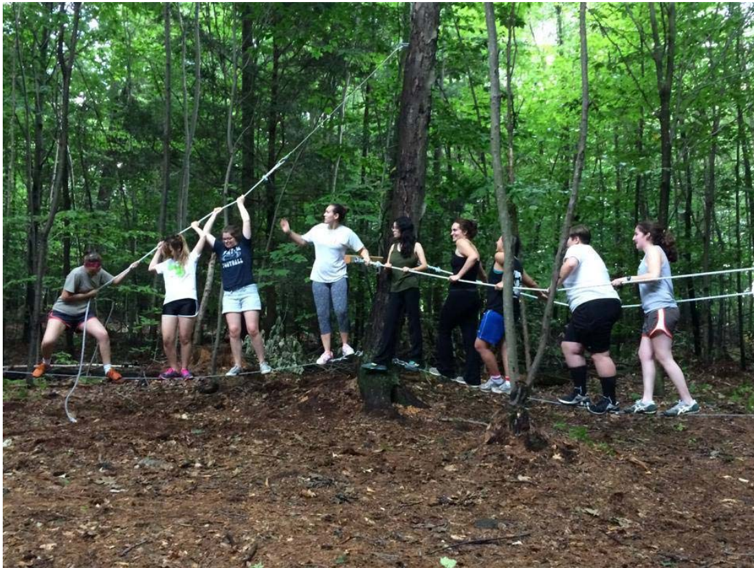
Image 14: Students from Emerson House work together on the Around-the-World element.

Within only a few weeks of that training, more than 200 students (primarily Residence Life staff) experienced the challenge course first hand, and they were quickly followed by the Student Government Association, house councils, several athletic teams, the Outdoor Adventure Programs, and other classes. Seventy students participated in activities on the challenge course on Mountain Day alone.