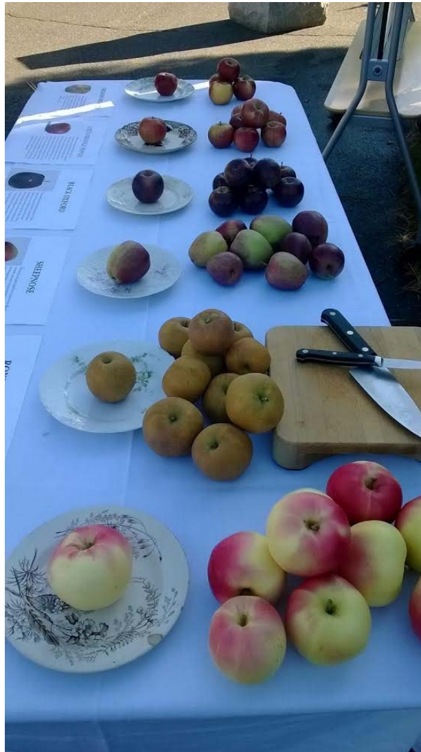
Image 2: CEEDS collaborated with Dining Services at this year's annual Cider Pressing to offer tastings of local cheeses and heirloom apples.

The role of CEEDS in the education of Smith students continues to grow and develop. During the 2014-2015 year, CEEDS interacted with thousands of people – from students and faculty to community members and local leaders. Our energies were directed towards increasing our visibility and connections on campus and within the greater Five College area. To this end, the year saw collaborations deepen with a number of Smith offices and programs, several local non-profit organizations, and members of the Five College consortium – Amherst, Hampshire, Mount Holyoke, and UMASS-Amherst.