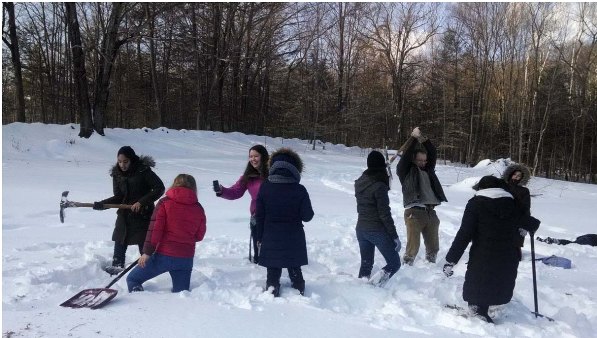
Image 8: Students from BIO 205 collecting samples through layers of snow at MacLeish.