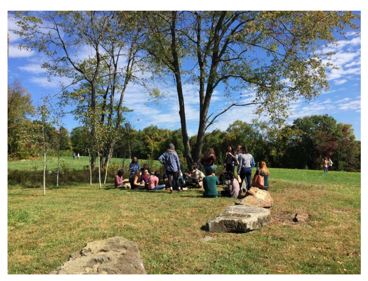
Students enjoy a beautiful Mountain Day at the Ada and Archibald MacLeish Field Station.