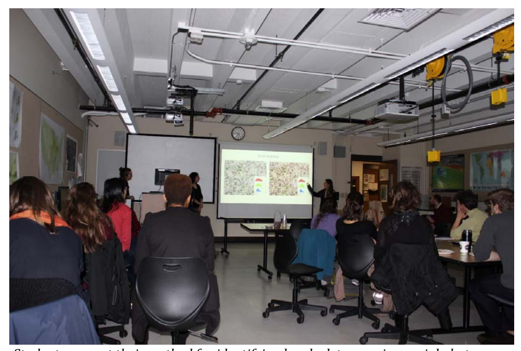
Students present their method for identifying hemlock trees using aerial photos.

The fall 2015 semester-long group projects (see list below), carried out in partnership with local non-profit conservation organizations Mass Audubon and the Kestrel Land Trust, successfully enhanced student learning. In evaluating the course, one student said, "I really enjoyed being able to work with a community partner and I hope that more classes at Smith can include this aspect of learning. I found that it really motivated me, more than grades ever could, to do a good job."