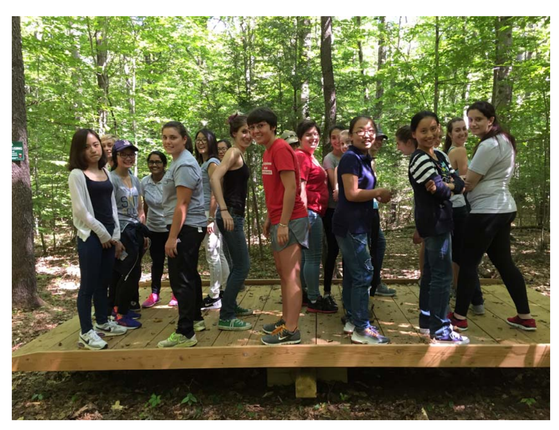
Students in the "Adventures at MacLeish" First-year Orientation group work together to balance on the Whale Watch element.

In addition to the challenge course, many students in exercise and sports studies courses took advantage of the "Outdoor Sampler" class and a class in primitive wilderness skills, both of which met frequently at MacLeish. Students used the fire pit, trails and both the group and remote campsites as part of these classes.