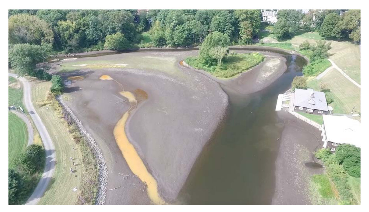
Drone image of sediment-filled Paradise Pond bottom exposed during a partial drawdown in September 2015. (See Section 4.1 for more on the Paradise Pond sluicing project)

During 2015-16, CEEDS again financially supported the post-baccalaureate position in the SAL. This staff position benefits faculty and students across the divisions and, in addition to class and research support, allows the SAL to offer workshops and timely opportunities for the Smith community to engage with real-world issues, such as helping map damage in the aftermath of earthquakes in Ecuador and Japan.