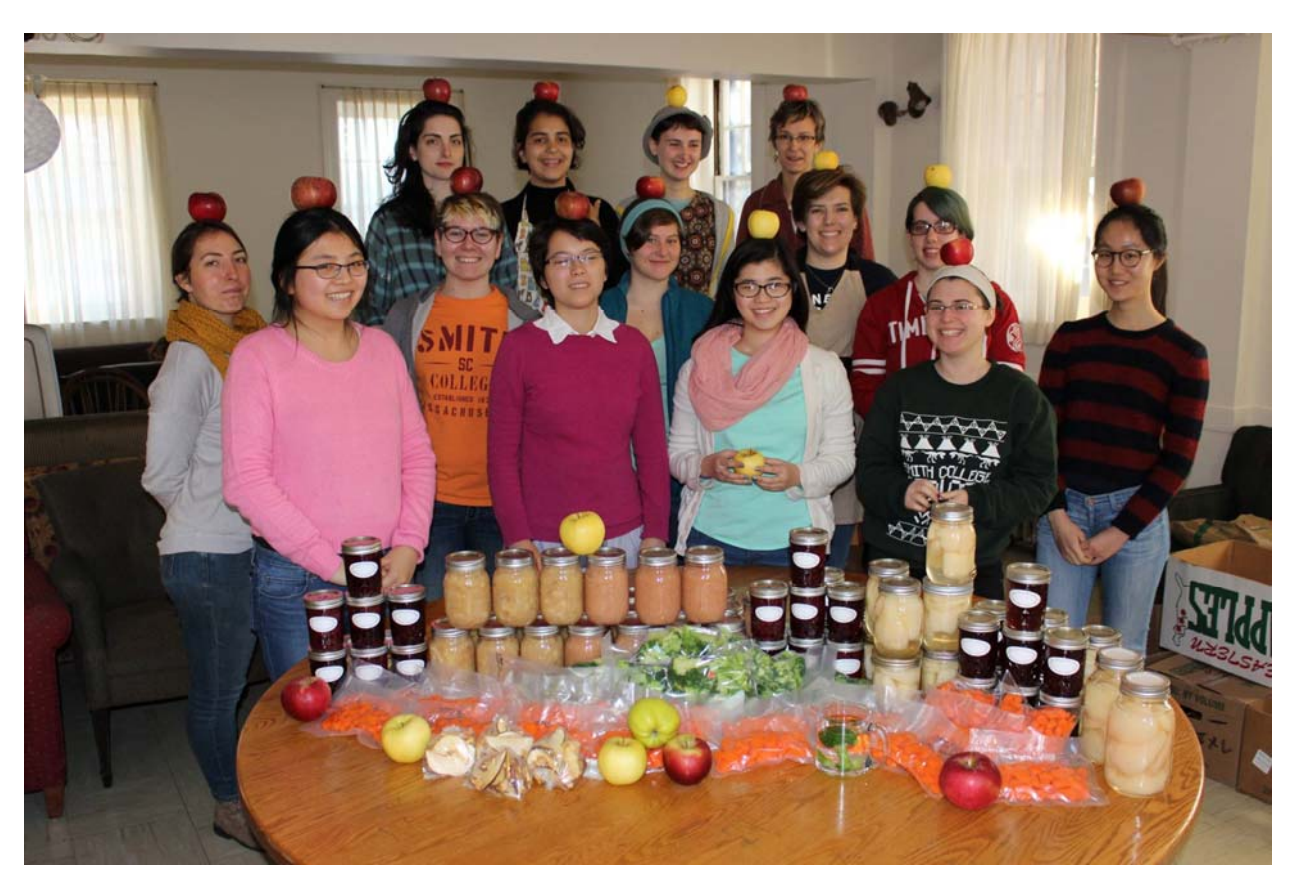
We also have fun while we work! Some of the "Putting Food By" class participants ham it up with their finished products.