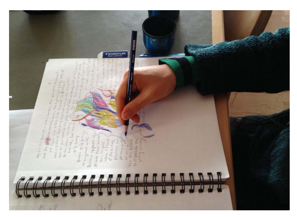
Student sketching during the Eco-Poetry workshop at MacLeish.