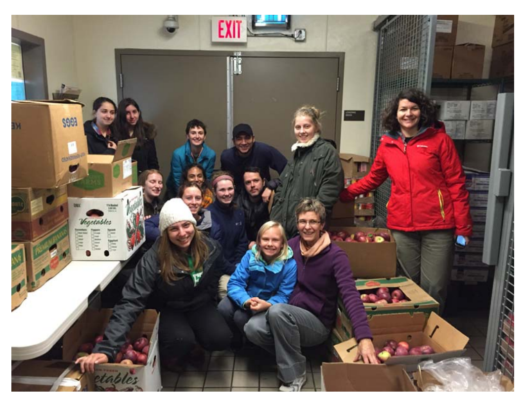
Students, staff and visiting environmental fellows with the many boxes of apples they gleaned for a Springfield soup kitchen with local organization Rachel's Table.

The role of CEEDS in the education of Smith students continues to grow and develop. During the 2015-2016 year, CEEDS interacted with thousands of people—from students and faculty to community members and local leaders. Our energies were directed toward increasing our visibility and connections on campus and within the greater Five College area. To this end, the year saw collaborations deepen with a number of Smith offices and programs, several local non-profit organizations, and members of the Five College consortium—Amherst, Hampshire, Mount Holyoke, and UMass-Amherst.