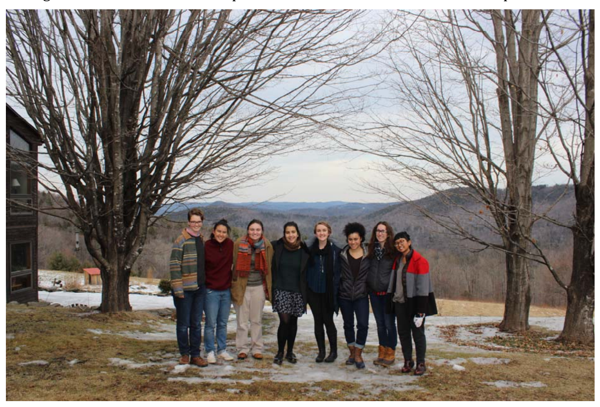
This winter juniors and seniors went on a mini-retreat with staff from CEEDS and the Wurtele Center for Work and Life to reflect on their experiences within the concentrations.

determined the appropriate size of commercially available units needed, estimated economic returns and projected how much each system would reduce the college's carbon footprint. The class also considered the educational benefits of each system and conducted a short survey of faculty asking if they would use either digester as a teaching tool. The students felt that processing organic waste on campus would make available an important teaching tool and result in valuable products that could then be used on campus.