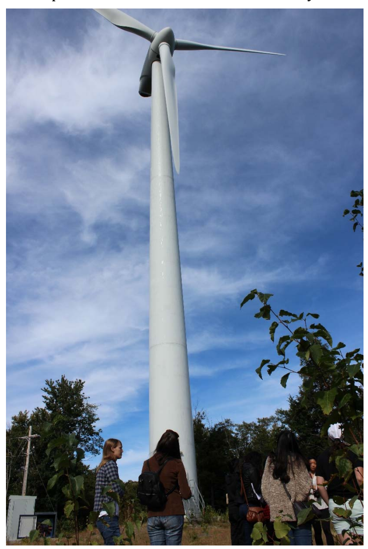
Students learn firsthand about wind energy.

The core of the project consisted of paired in-class readings and material for CLT 204/SPN 356: Spanish Literature of the 17<sup>th</sup> century and CHM346: Environmental Analytical