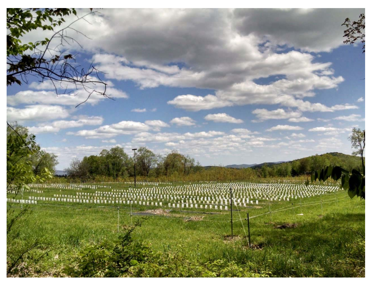
The fully planted American Chestnut seed orchard at MacLeish.